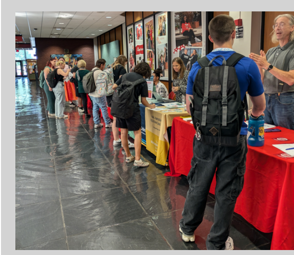
Students visit the Fall 2024 Study Abroad Fair

There is still time for students to apply for studying abroad through opportunities such as our faculty-led programs scheduled to take place over Spring Break and in the summer. If you know of an interested student or want to encourage your class to consider this opportunity, please send them our way!