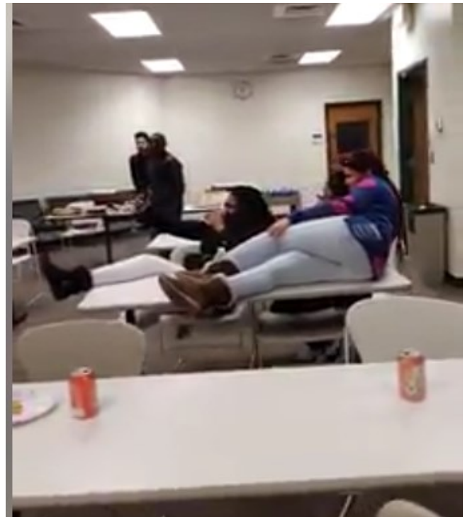
Students strike a pose for the Holiday Workshop Mannequin Challenge