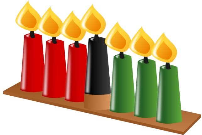
Kinara with candles (Symbol for Kwanza)

Community involvement is an important part of UBMS because giving back to the community fosters an environment of growth and provides volunteers with a sense of hope and belonging. Good job to all of our UBMS students who volunteered their time to help those in the community!