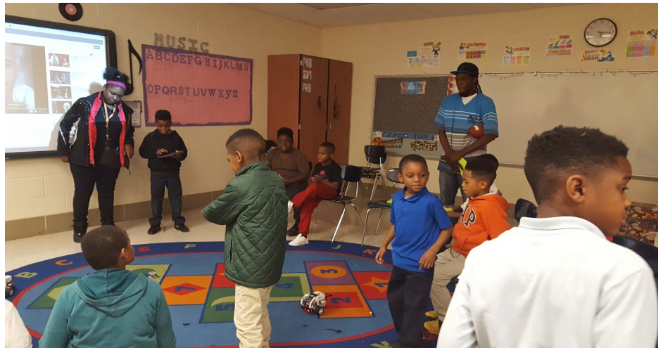
(Right) Students show children at Katie Wright Elementary how the robots work.