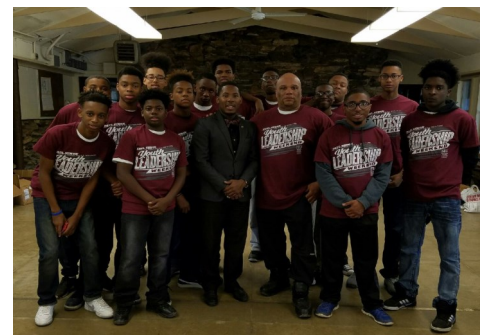
Students pose for a picture at the Paul Simon Leadership Conference

Part of our orientation was also designated to review the program's rules and policies on behavior, dress and attendance/participation. Students were encouraged to develop good study habits and participate in extra-curricular activities. UBMS Saturday Sessions are always held on the 2nd and 4th Saturdays of each month and we will be sure to notify students if there are any changes. Attendance and participation at these sessions is critical